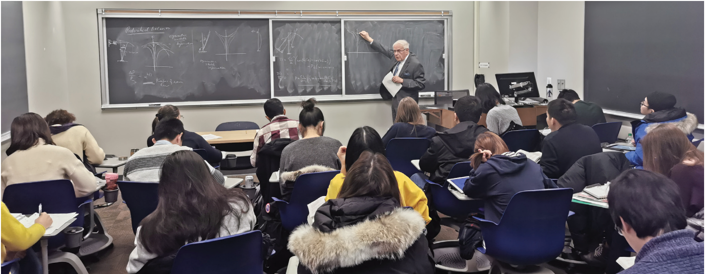
Zdeněk Bažant teaches Stability of Structures, a popular course for graduate engineering students, in November 2019.